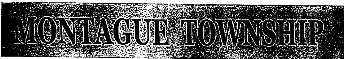
Figure 1: Silver Montague Waste Sticker